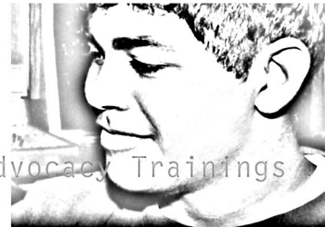
Media Advocacy Trainings